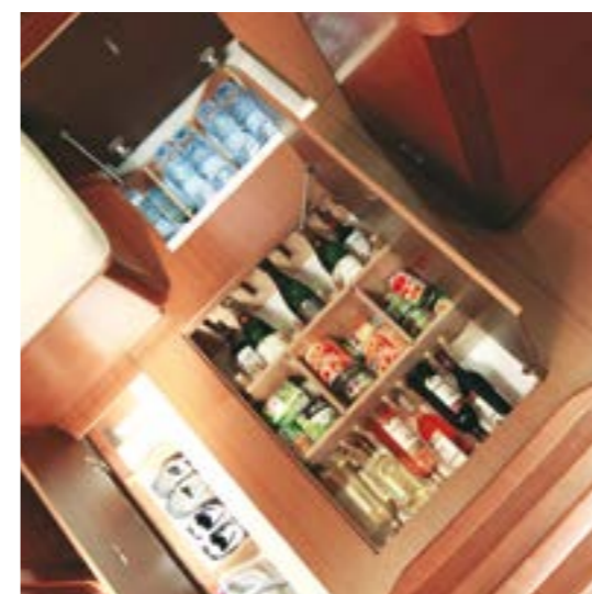
La cave à vin. Pour les grands crus du Grand'Large. Wine cellar. For those vintage wines that are the very image of the Grand'Large.