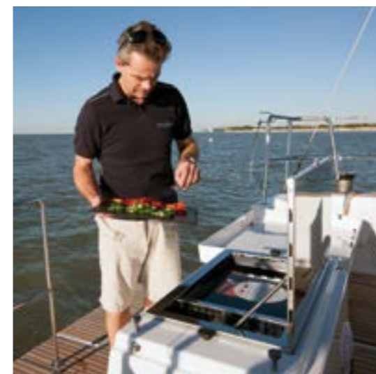
La Plancha. L'extérieur comme 2 ème intérieur. The terrace area. The outside like a second interior.