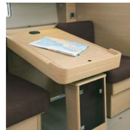
La modularité. Le pouvoir d'adapter l'espace au besoin du moment. Modularity. The ability to adapt the space to the requirements of the moment.