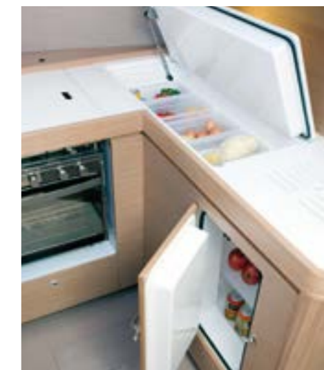
La cuisine du Chef. Aussi pratique et complète qu'à la maison. The Chef's galley. As practical and complete as at home.