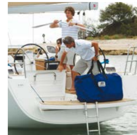
La plage arrière. Un espace dédié à chaque chose. The quarterdeck. A space dedicated to every thing matter.